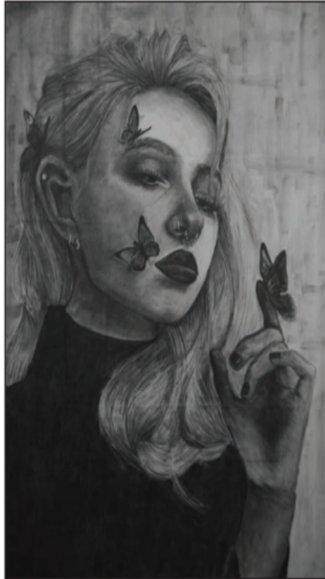
"Tender Creatures" by Melody Gallant.