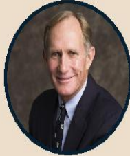
Peter Agre, MD

Nobel Laureate, Bloomberg Distinguished Professor at JHU Bloomberg School of Public Health, Director of JHU Malaria Research Institute