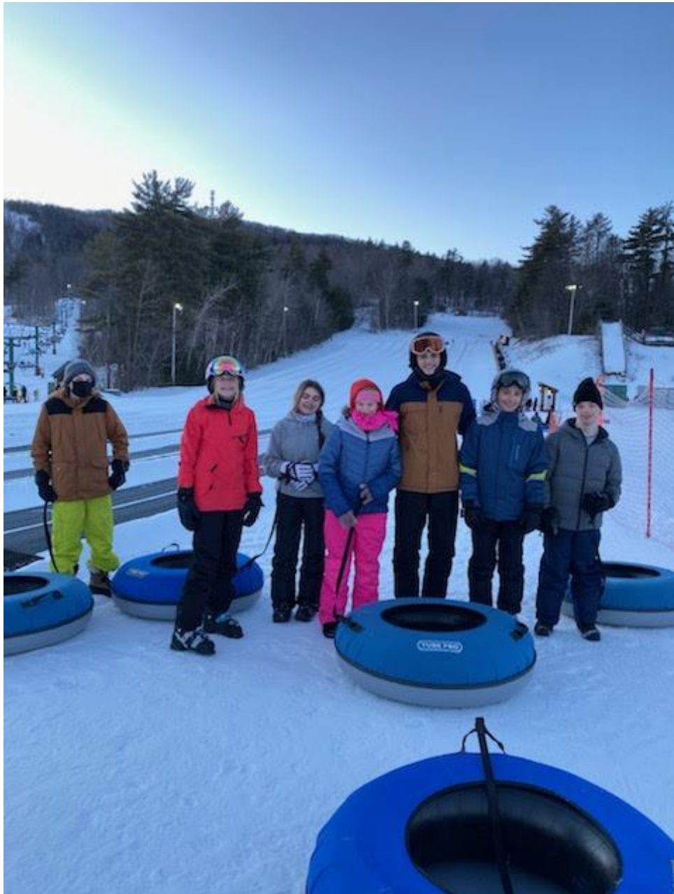
The Unified Club went tubing at Gunstock on Wednesday evening. All of the students and staff had a memorable evening.